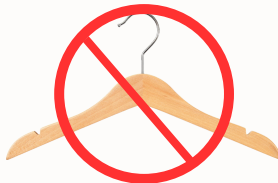
You are welcome to bring your clothing on hangers but we cannot keep them. We have plenty of hangers.

Large items that do not fit in the above containers are accepted, please let a volunteer know when you arrive. If your donation does not adhere to the above requirements, we will not be able to look through and accept your donation.