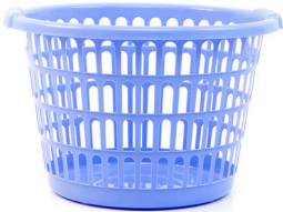
Laundry basket or plastic storage bins (2 maximum). Note: We will not be able to keep the basket or bins, they will be given back to you after we go through your donation.