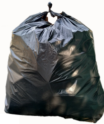
1 large black 30-35 gallon lawn bags or 2 tall 13 gallon kitchen trashbags