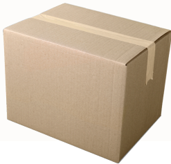
2 small/medium boxes or 1 extra large box